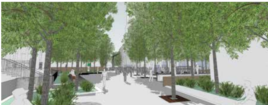
▲ Looking north from Margaret Graham Building (left) and Marnirni-apintheta (right), towards the Entrepreneur and Innovation Centre.

This landscaped public and community space will include new paving, street furniture, plants and the addition of 36 new trees as well as a water feature and is scheduled for completion in mid-2022.